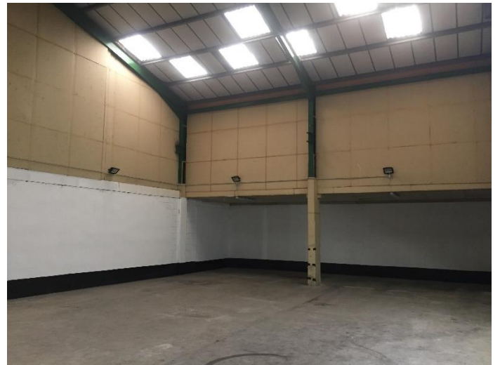
Unit 1 Warehouse