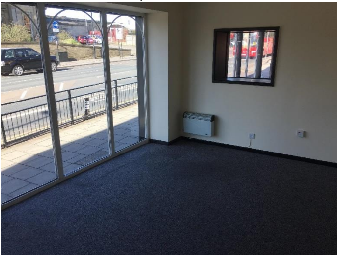
Unit 1 Reception